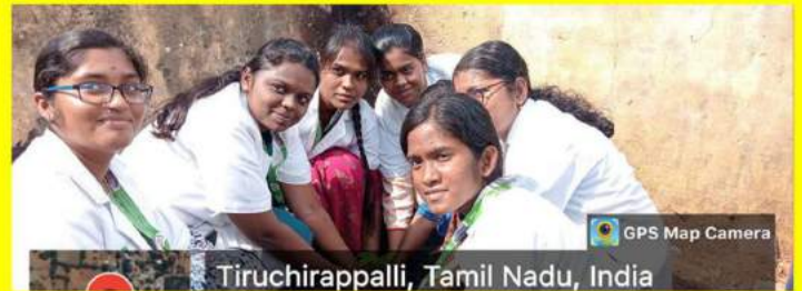
Tiruchirappalli, Tamil Nadu, India

The visit encouraged students to explore narrow lanes and historical sites, offering glimpses into both the past and present. Inspired by the experience, they are eager to support conservation projects aimed at preserving our heritage. As they continue their journey, DSU remains committed to fostering a deep appreciation for history and culture among its students.