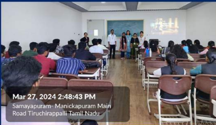
Mar 27, 2024 2:48:43 PM Samayapuram- Manickapuram Main Road Tiruchirappalli Tamil Nadu