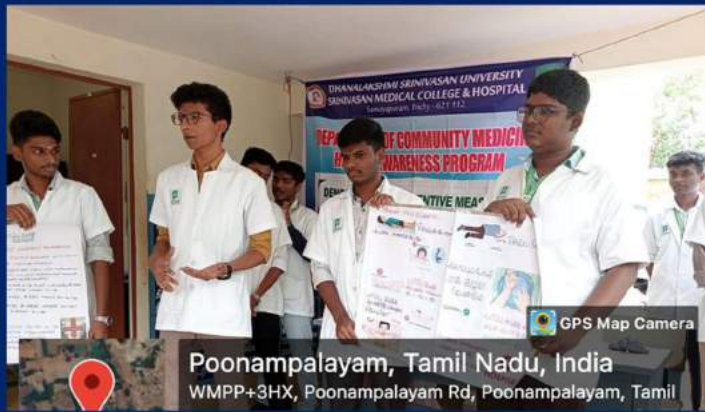
Poonampalayam, Tamil Nadu, India WMPP+3HX, Poonampalayam Rd, Poonampalayam, Tamil