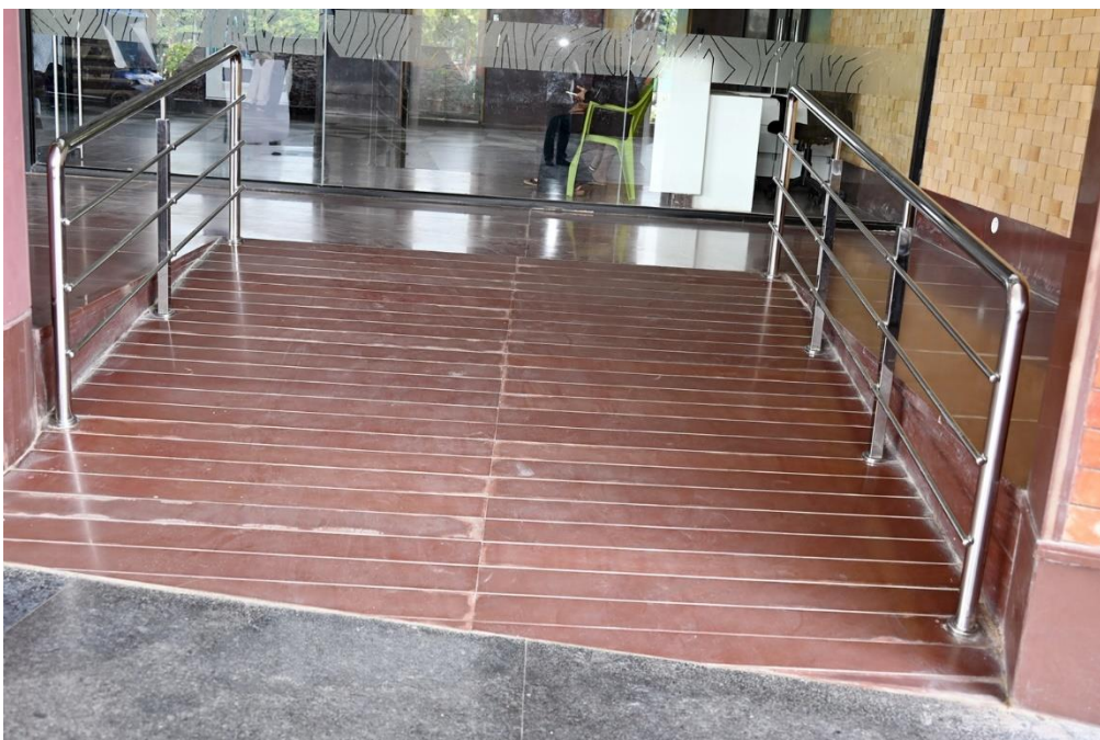
Ramps for physically challenged.

Research and Innovation: DSU is actively involved in research that addresses inequalities, including disparities in healthcare, gender inequality, and income inequality. Research activities contribute to understanding and mitigating societal issues related to inequality. But these are still at nascent stage since the University itself is at a nascent stage starting its operations in the year 2021.